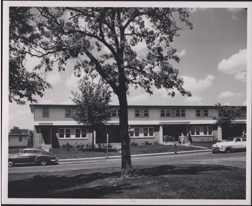
Unidentified townhomes at Glendale Public Housing, undated.