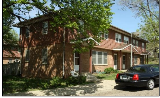
100-106 Twenty-Seventh Avenue Southeast, Type D, view northeast.