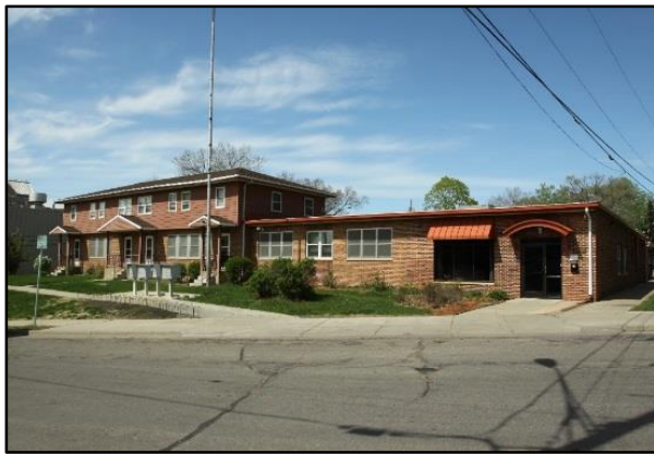
2701-2705 Essex Avenue Southeast, Type E, view north.