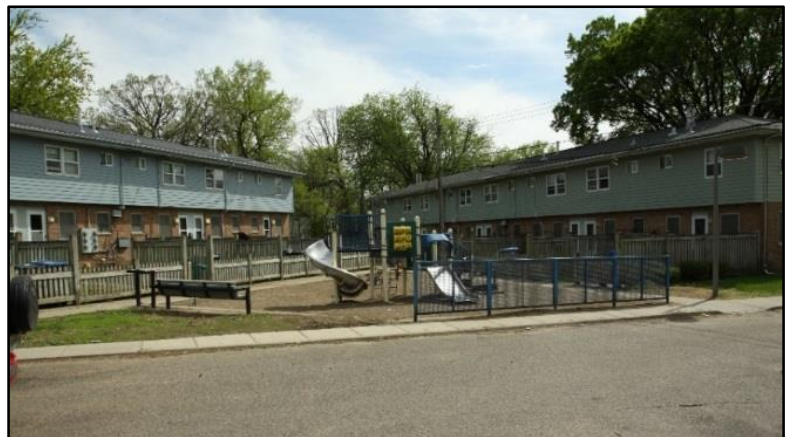
Playground behind 42-52 Williams Avenue and 2837-2851 Delaware Street, view southwest.