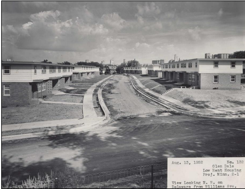
View of Glendale northwest down Delaware Street, 1952.