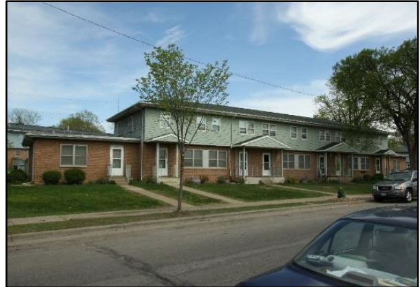
2821-2835 Delaware Avenue Southeast, Type F, view southeast.