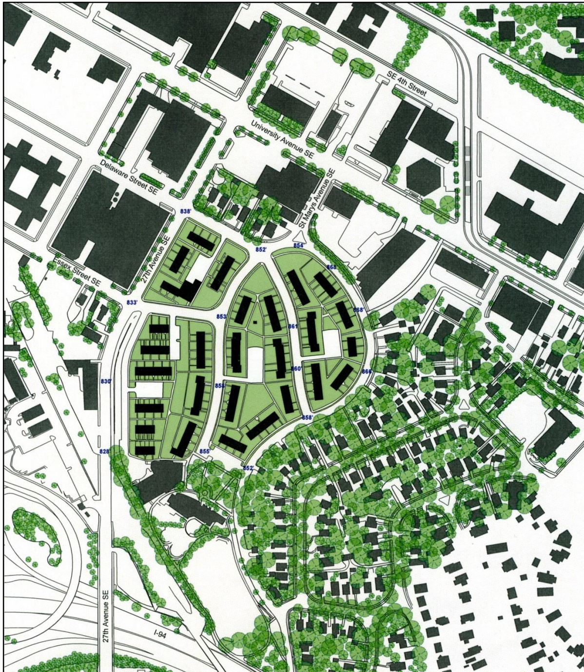
The Glendale Public Housing Project is shaded green. The Prospect Park Residential Historic District is to the east-southeast.