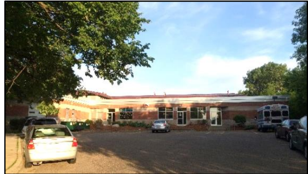
The Glendale Early Childhood Family Development Center, view southeast.