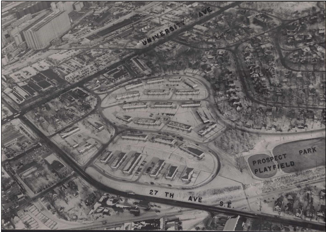
Glendale shortly after its construction (above; MHRA Archives, Minneapolis CPED) and today (below; Google Earth map). The integrity of the project's overall design is very good.