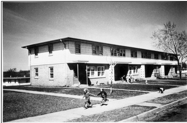
Children playing in front of Glendale, c. 1955.

In contrast, Glendale exemplified family-friendly public housing. The majority of the community's residents were children, who enjoyed easy access to Glendale's playgrounds and the neighboring park. Services grew as the project evolved. In March 1969, the project began offering the city's first privately funded Head Start classes, which attracted twenty children. All were eligible to start kindergarten the following fall, attesting to the number of families living there. A few years later, the Glendale Child Development Center opened and provided daycare for children living throughout the Prospect Park neighborhood. 25