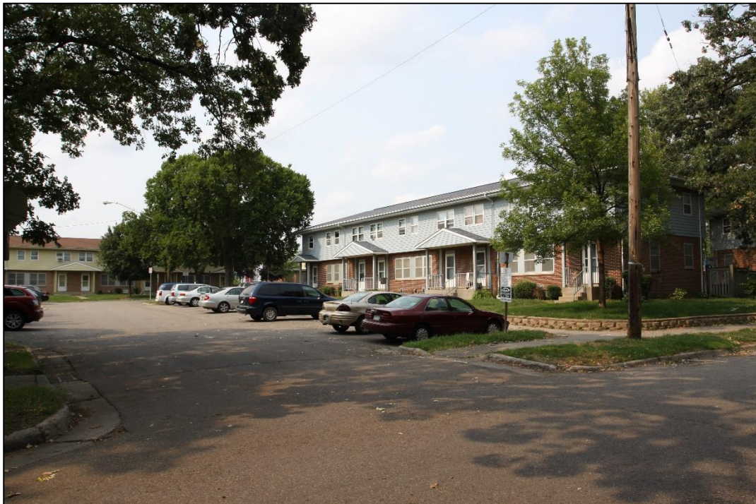
View northwest from Williams Avenue down Saint Mary's Place. The altered porticos and roofline can be compared with the original configuration in the photograph above.