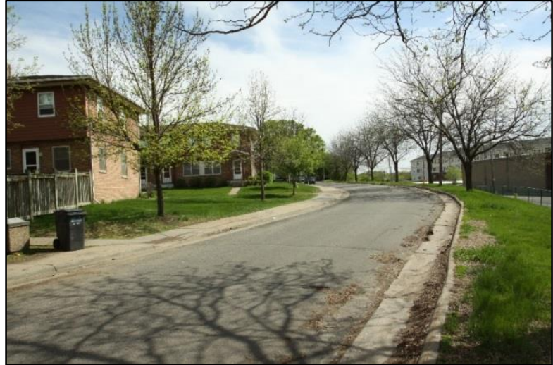
Twenty-Seventh Avenue showing the curvilinear street plan, view south.

While the window units on all buildings have been replaced, the historic openings have been preserved. In addition, the original brushed-aluminum exterior framework for the first-floor windows, which incorporates combination storm windows and panels between windows, remains in place on the primary facades. This establishes a pattern of fenestration that is a distinguishing feature between building types. The brushed-aluminum trim for the single and paired windows on the second floor was removed during the 1989 renovation. The side walls have four one-over-one windows, two on each floor. On the rear facades, the first floor holds a door for each unit and one-over-one windows, and the second floor has one-over-one windows and small sliding windows. All of the windows on the first floor have historic, projecting stone sills. The sills on the second-floor windows do not project.