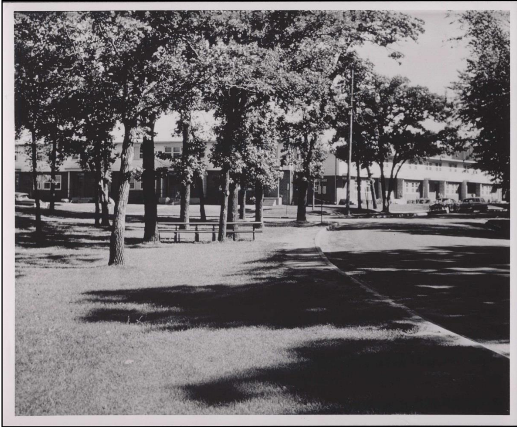
Unidentified street at Glendale, undated, note curving street and greenery.