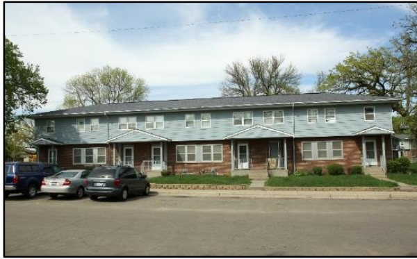
2801-2811 Saint Mary's Place, Type C, view northeast.