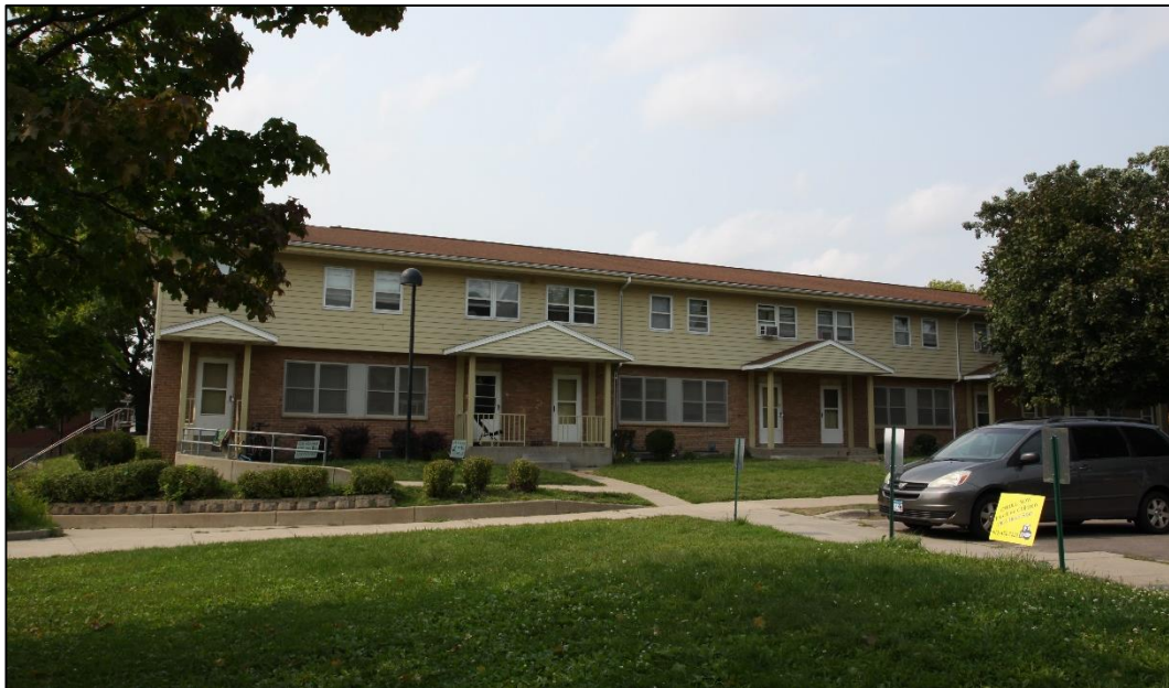
View northwest of 76-90 Saint Mary's Avenue Southeast. Note the redesigned porticos, altered roof, and loss of the aluminum framing at the second-story windows.