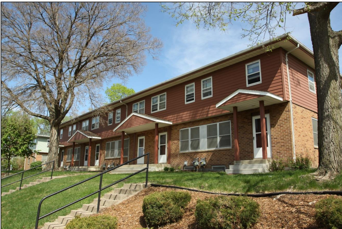
166-176 Twenty-Seventh Avenue Southeast, view east showing typical townhome.

Research was conducted in Hess Roise in-house files and at the Minnesota Historical Society, Hennepin County Central Library, Northwest Architectural Archives at the University of Minnesota-Twin Cities, and City of Minneapolis. Mid-twentieth-century records of the Minneapolis Public Housing Authority archived at the city's Community Planning and Economic Development Department were particularly helpful.