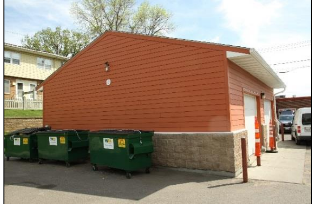
Garage behind 2701-2709 Essex Street, view southeast.

The Glendale Early Childhood Family Development Center is at the southern edge of the development. It extends over what was once the southern end of Saint Mary's Avenue, which no longer extends to the segment of Twenty-Seventh Avenue that serves the development. The one-story building was constructed in 1995 and holds a cafeteria, kitchen, laundry room, classrooms, offices, support spaces, a community food shelf, and resident council offices. The building has an irregular roofline; some sections are flat and others are gabled. It is clad in rock-face concrete, brick, and metal paneling.