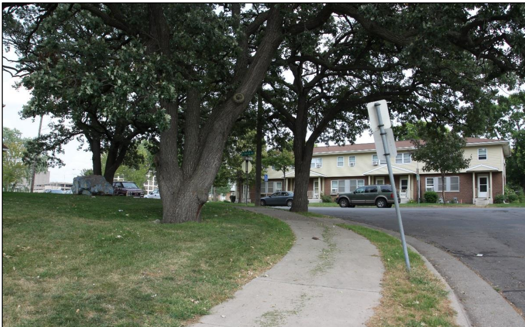
View northeast from the intersection of Essex Street and Saint Mary's Avenue showing the historic street alignment and landscaping.