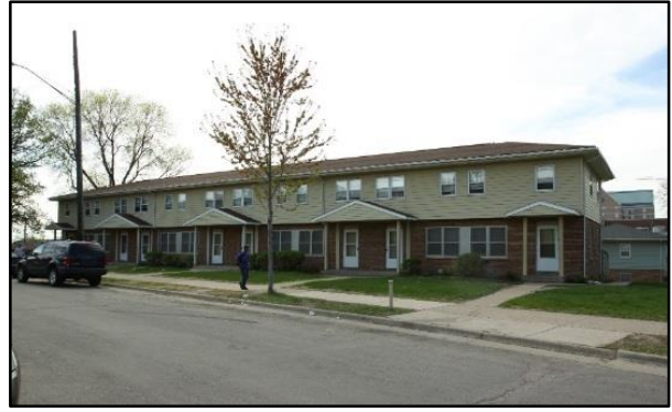
28-42 Saint Mary's Avenue Southeast, Type B, view northwest