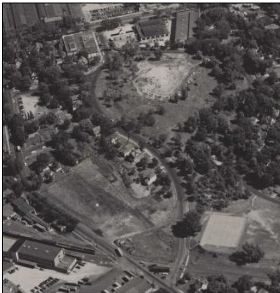
Detail from aerial view of Site F in August 1950.

Site F was located in Prospect Park, a Minneapolis neighborhood near the University of Minnesota. The area was first developed by real estate speculator Louis Menage in the late 1870s. The surveyors incorporated the topography into their plan following the approach of prominent landscape designer Andrew Jackson Downing, a proponent of curvilinear streets,