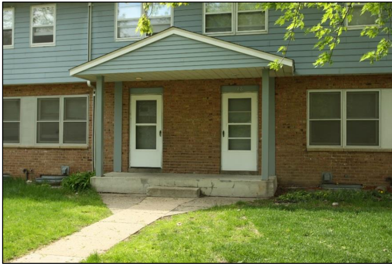
Shared portico on 42-52 Williams Avenue, view southeast.

Front doors were originally sheltered by flat-roofed canopies, which were supported by simple posts or precast concrete panels. Pilasters that flank some doors today indicate where the concrete panels were once attached to the brick walls. In 1989, the canopies were enlarged and modified with gabled roofs supported by rectangular metal posts. Concrete thresholds are sometimes approached by concrete steps.