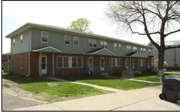
2700-2710 Delaware Street Southeast, Type A, view southwest